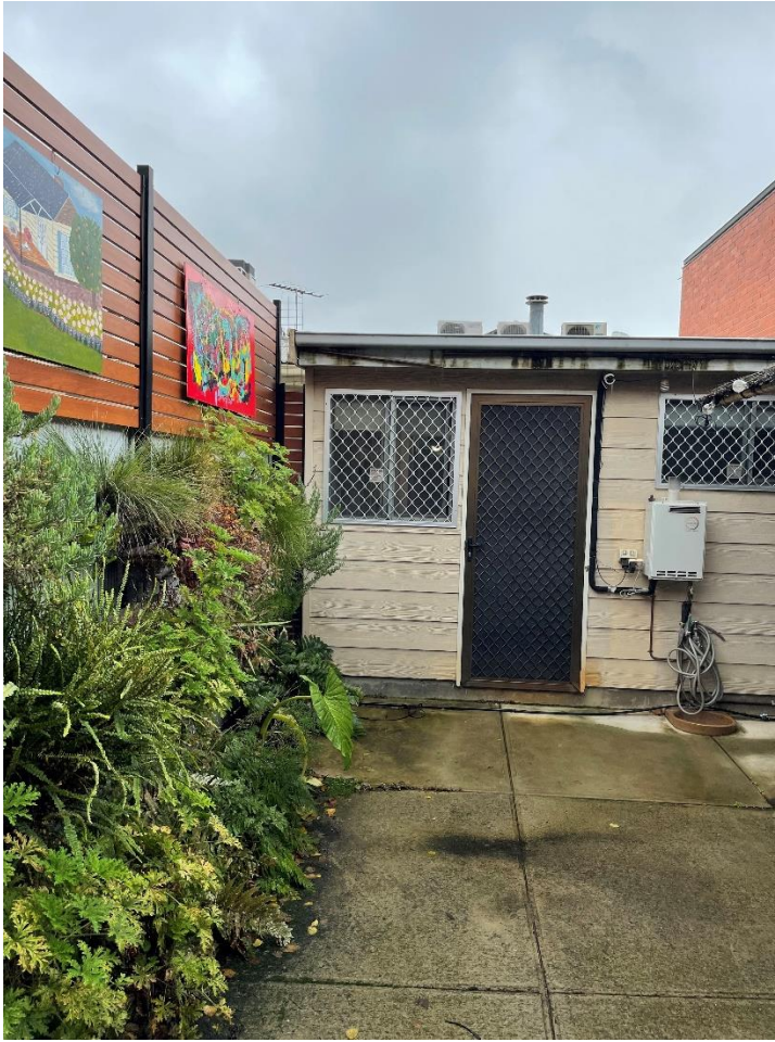
Photo 3.8 - Looking south from rear yard of subject site