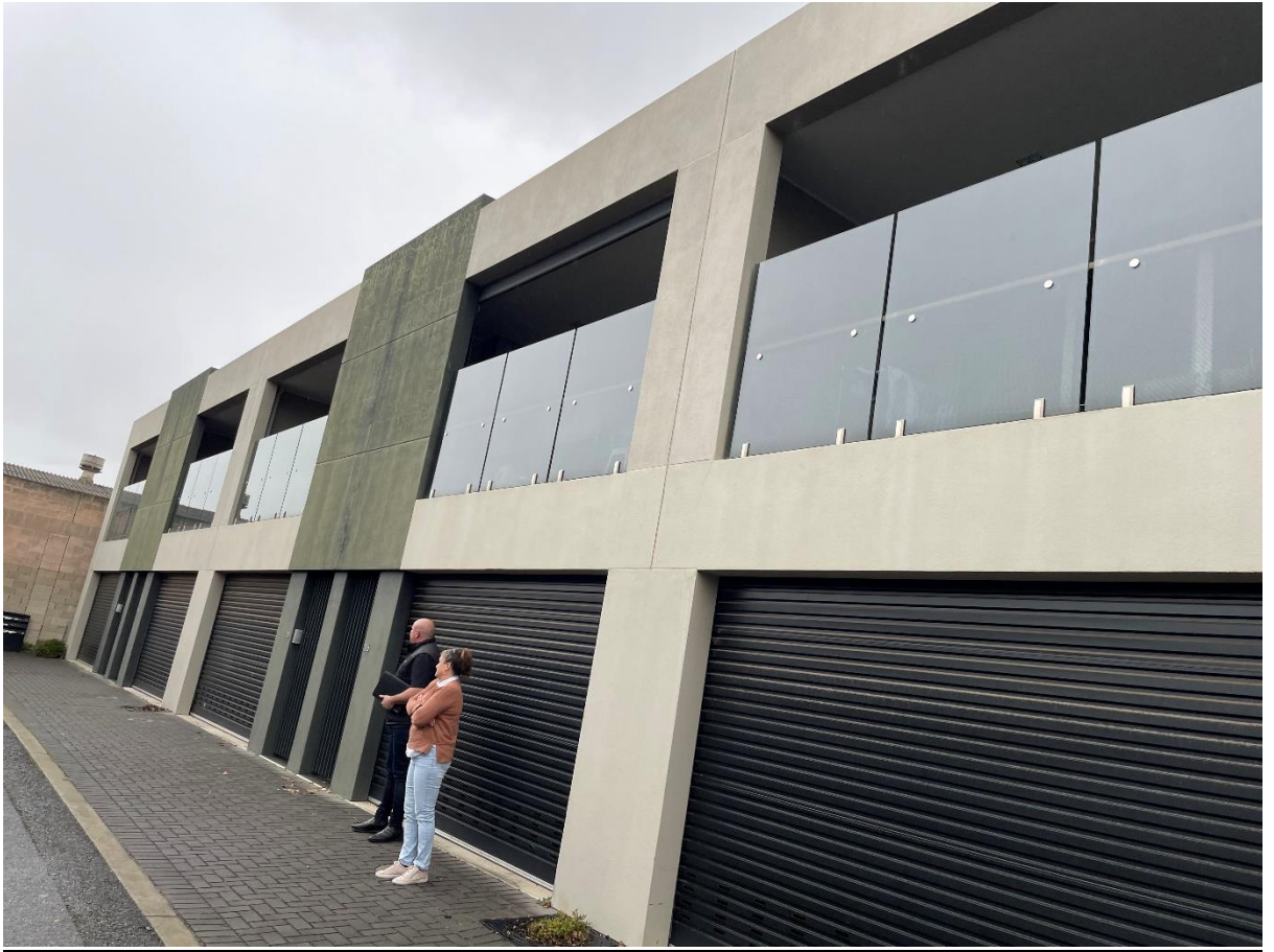
Photo 3.6 - Looking east towards Gray Court from northern end of Petronella Lane