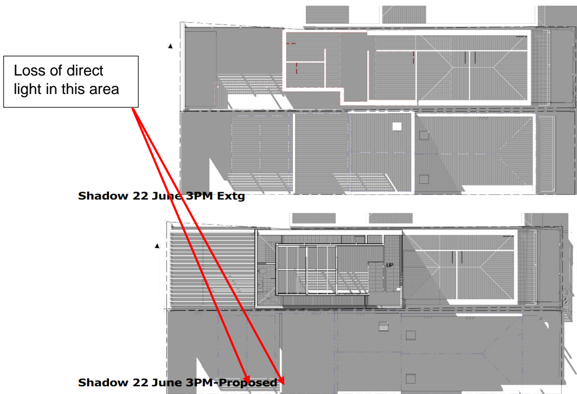
Figure 9.5.3 – 3pm Winter Solstice

At 3pm, there will be minimal change to overshadowing to the private open space of 15 Gray Court, with a loss of approximately 1m 2 . A loss of direct sunlight will occur to a 500mm portion of the habitable (living room) window at 15 Gray Court as shown in Figure 9.5.3. The skylight at first level will also be overshadowed at 3pm (noting this skylight has direct access to light between 9am and 12pm).