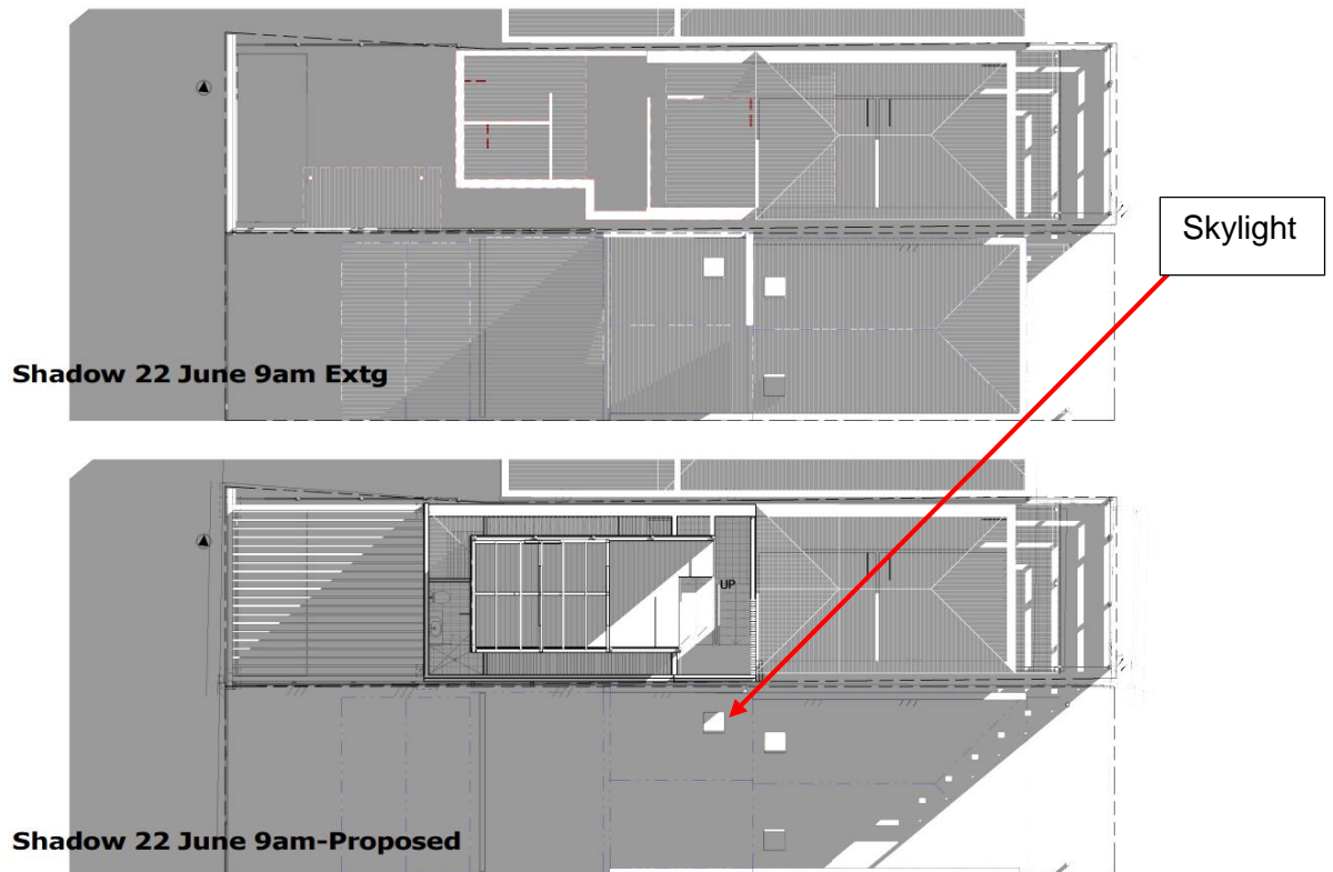
Figure 9.5.1 – 9am Winter Solstice

Noting some shadow will be cast over portion of the skylight associated with a bedroom at 15 Gray Court (at first level), a skylight is not a 'window' and PO/DPF 3.1 does not apply. The shadow diagrams demonstrate the skylight will continue to receive direct access to sunlight to a majority of its face between 9am and 12pm.